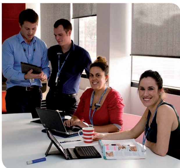
Third year medical students preparing for a presentation to their class.

After many years' work between Werribee Mercy Hospital, the State Government and The University of Notre Dame, The University of Notre Dame Australia, Melbourne Clinical School at Werribee Mercy Hospital was officially opened in February 2012. This purpose built educational facility will be the centre of education for Werribee Mercy Hospital so that current and future healthcare professionals can be developed through coordinated programs that reflect our values and approach to providing care.