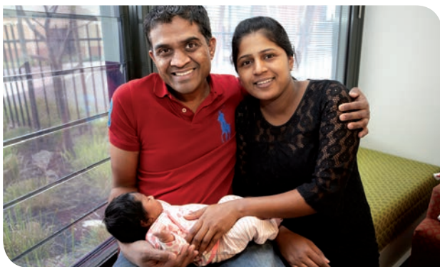
The new state-of-the-art maternity facility at Werribee Mercy Hospital gives women and families in the Wyndham area access to some of the best maternity services in Australia.

The hospital is expanding its obstetric and maternity capacity to better meet the needs of the community and deliver the best public healthcare possible. Two new obstetricians and gynaecologists have been appointed, as well