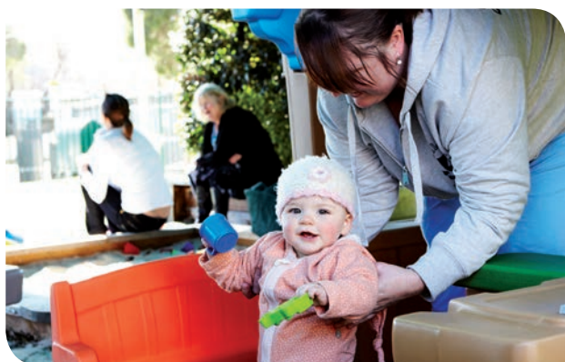
Building relationships through play.

Mercy Health O'Connell Family Centre is a specialist early parenting centre supporting families of 0-4 year olds across Victoria. The residential, day and community programs provide child focused parenting skills to promote safe child development, and the centre is increasing its supports for vulnerable families including families with mental health issues.