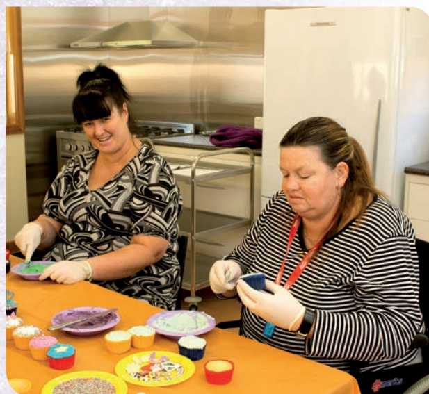
Mercy Mental Health Community Care Units residents prepare morning tea for the opening of the kitchen.

Reflecting on the feelings of isolation that are too often associated with mental health issues, a resident said, "The new kitchen will help us come together and share food as a community."